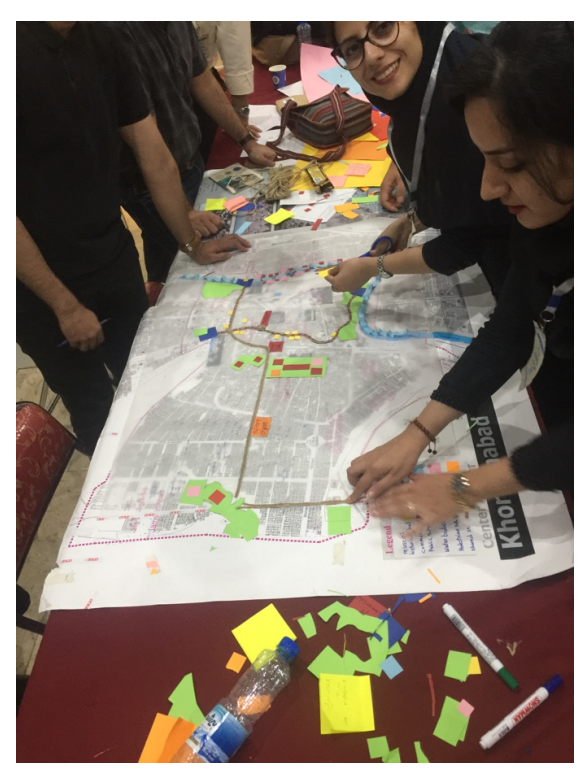
Figure 3. Designing together the healthy corridor for Old Bazar in Khorramabad, Iran. Workshop with local stakeholders, October 2017.