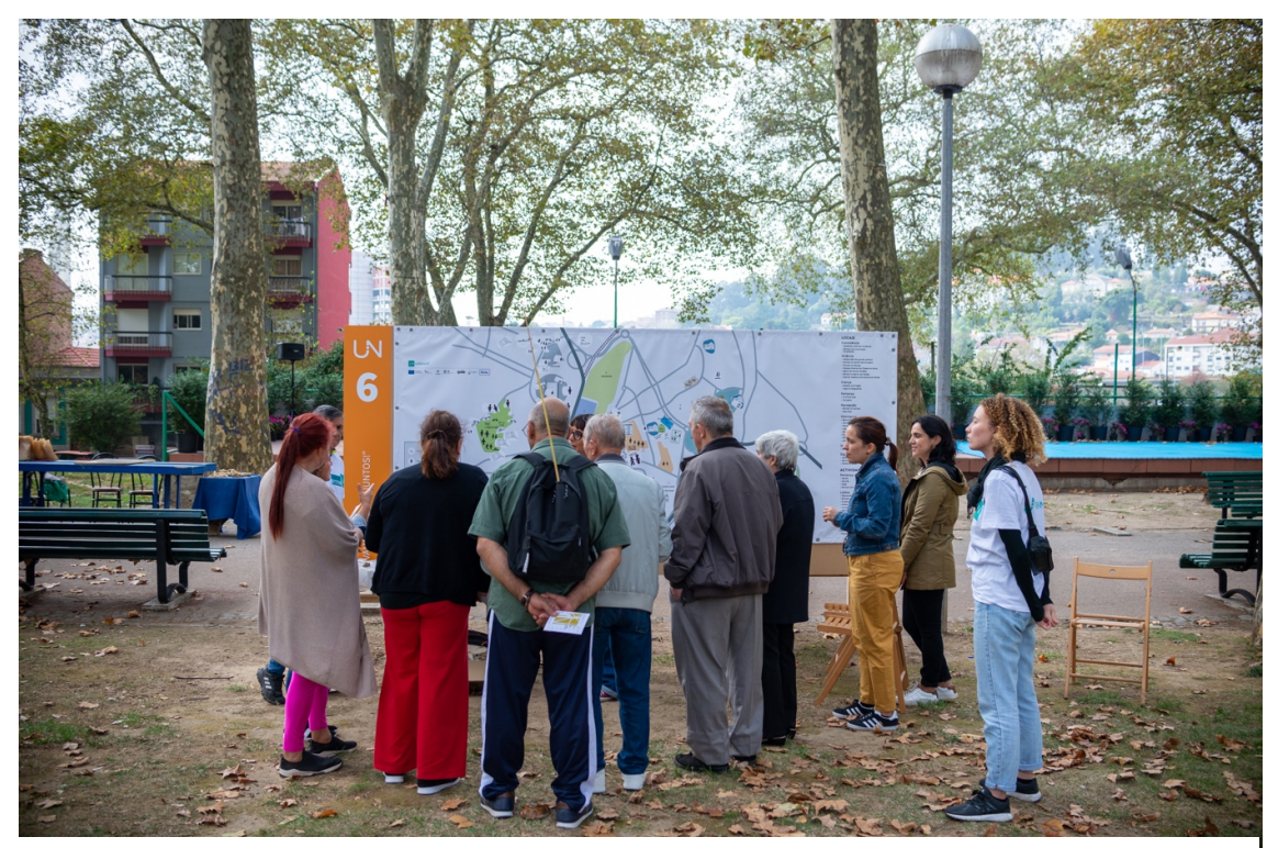
Figure 1. Mapping together what citizens do, like, and want to change. Porto, kick-off event, October 2019.