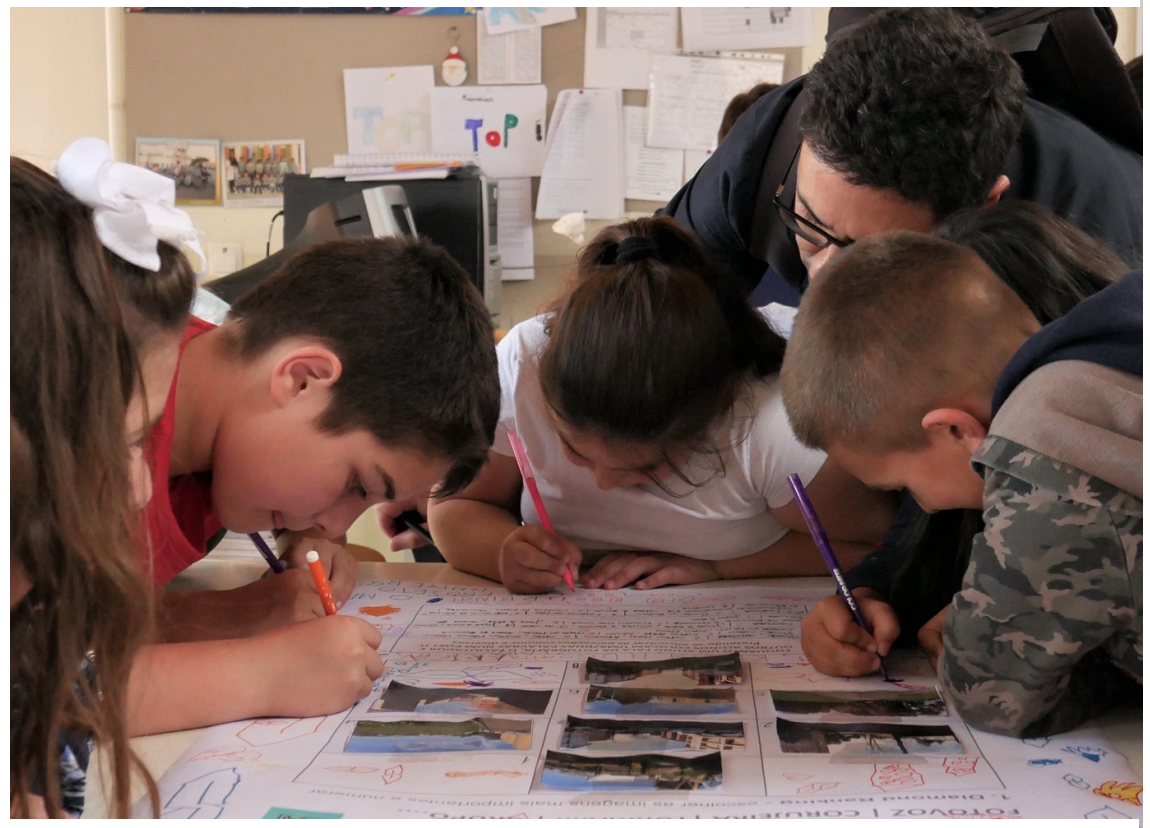
Figure 2. Understanding the challenges of the regeneration of public space by means of photovoice, in which pictures represent children's views and discourse. Falcão School, Porto, 2019.